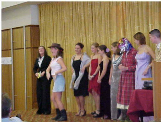
One of the many skits at the 2001 Reunion in N.I.

This past summer 80 families from across the United States opened their hearts and homes to Catholic-Protestant pairs of teens from Northern Ireland.